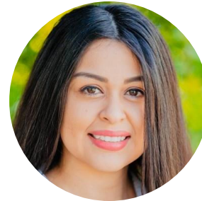
Project Manager II CALSTART