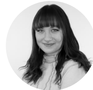
Project Manager CALSTART