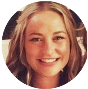
Program Manager CALSTART