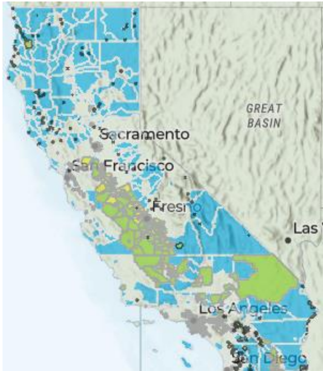
Priority Populations 2023 Update