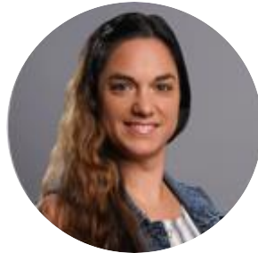
Lead Project Manager CALSTART